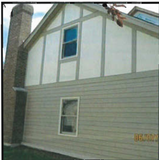
Example of possible siding pattern #1