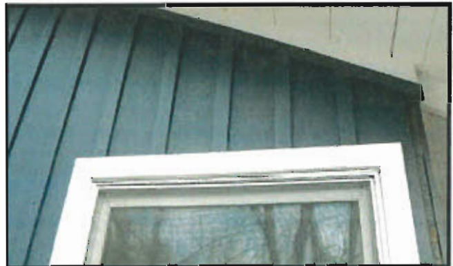
Example of possible siding pattern #2