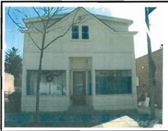
Existing conditions of 21 North Cass Ave.

The purpose of the facade grant program is to promote the use and maintenance of buildings in the Central Business and South Westmont Business TIF Districts by providing funds to restore the historical appearance of the properties. The grant program recognizes the positive impact that individual facade improvements have on the overall appearance, quality, and vitality of the TIF business districts.